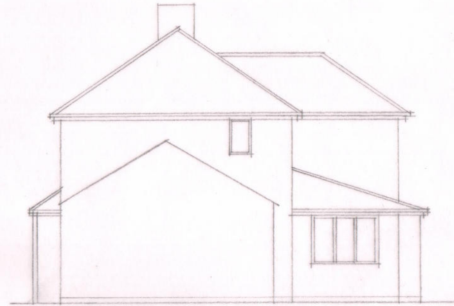
SOUTHEAST ELEVATION AS EXISTING 1:100