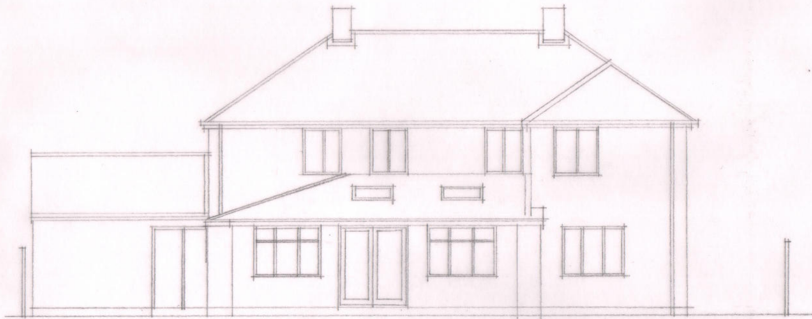
REAR ELEVATION AS EXISTING 1:100